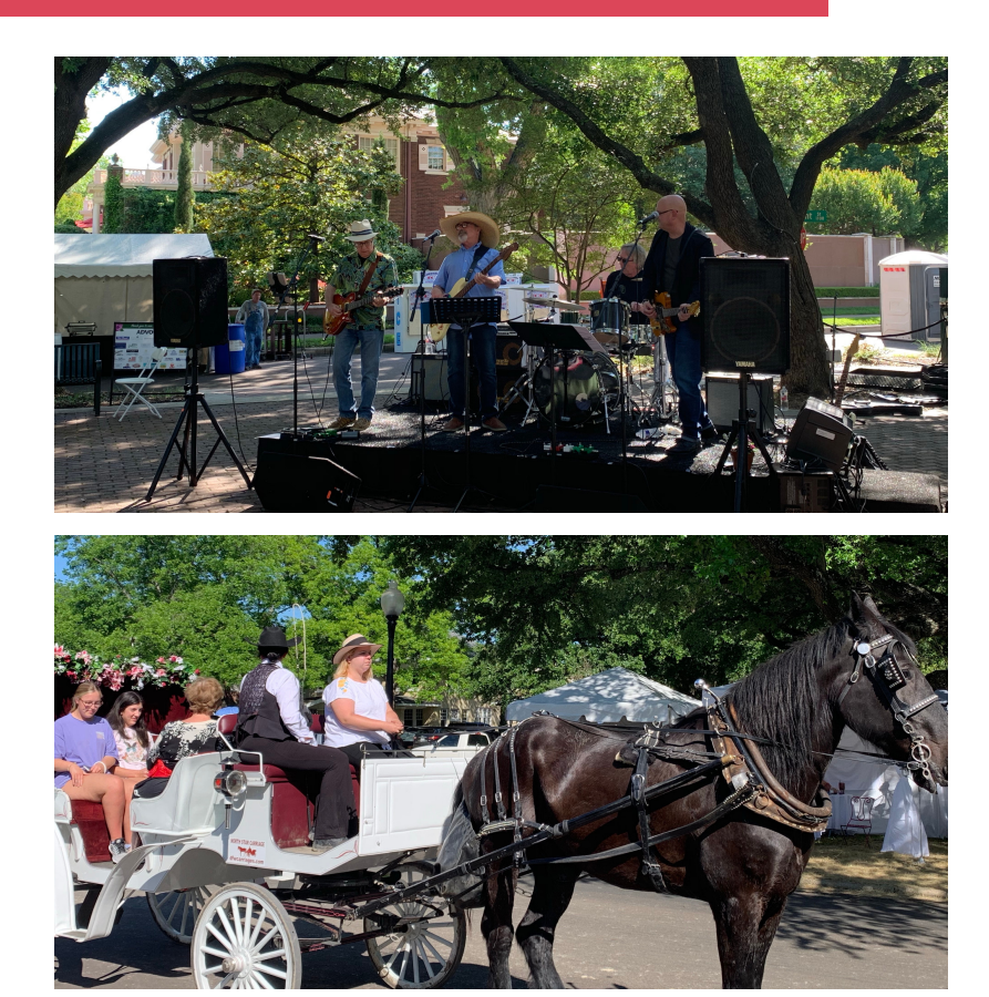
Top Photo: The Restoration Blues Band closes out the weekend. Bottom Photo: A horse drawn carriage takes Home Tour guests to their next stop

The gracious and welcoming atmosphere created by each one of you helps to make thousands of lifelong memories for all who attend the Home Tour and has made this event into a true Dallas tradition.