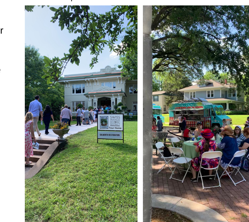
Left Photo: Lines begin to form outside 5125 Swiss Right Photo: People enjoy brunch and live music in Savage Park